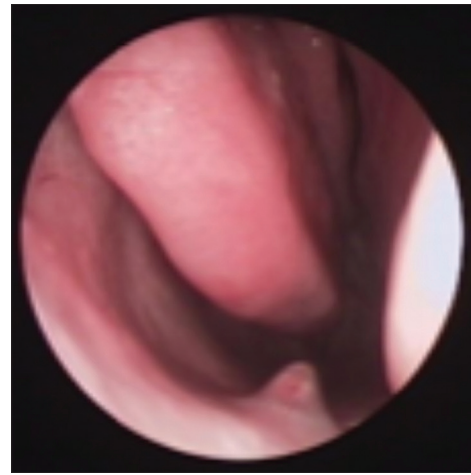
Figure 1: A clinical photograph showing an implant that is potentially protruding into the nasal cavity using sinuscopy

In the past few years, several authors have recommended the use of Corticobasal ® implants to achieve bicortical anchorage (e.g., crest of the ridge and maxillary sinus floor) and to ensure implant stability in patients with severe ridge resorption or compromised bone support. [26-36] Consequently, implants may have exposed to the nasal and maxillary sinuses [Figure 1] with possible challenging effects. Although many studies have reported that Corticobasal ® (BECES ® ) implants have very favorable outcomes with limited and manageable complications, [27-29,34-36] there is still some doubt concerning the effect of their penetration into the nasal and maxillary sinuses. In 2018, Lazarov [37] published a prospective cohort study in which patients treated with Strategic Implant ® technology who underwent placement of 375 BCS ® implants in 105 maxillary sinuses were followed for 3–4.5 years. The maxillary sinuses were assessed preoperatively on panoramic views and clinical examination. Patients with symptoms of