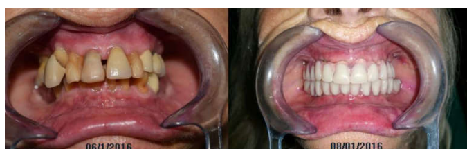
Figure 5. Pre and Post-operative intra oral