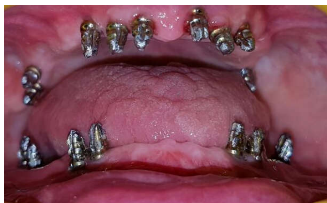
Figure 6. After one year, all the prostheses were removed and implants were firm

On the second day, the fit of the metal framework was verified on the patient (see Fig. 3). The metal framework was sent to the lab for the fabrication of the metal to acrylic hybrid prosthesis. Consequently, on the third day, the surgical site was irrigated with Betadine solution. Sutures were removed. The hybrid prosthesis was cemented over the implants after accessing the occlusion, retention and resistance (see Fig. 4