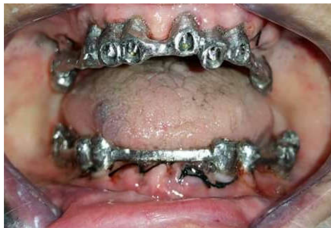
Figure 3. Metal framework trial