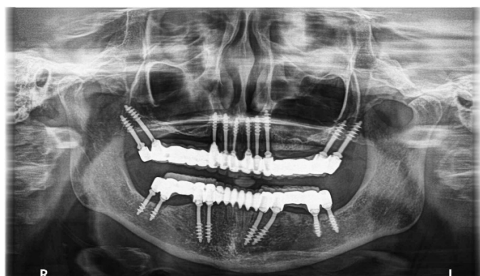
Figure 8. Post-operative radiograph (3 years)