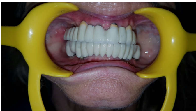
Figure 7. Intra oral post-operative view with new porcelain fused to metal prosthesis that was fabricated