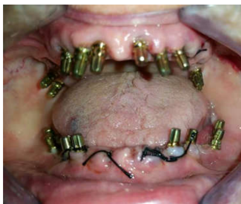
Figure 2. Implant placement