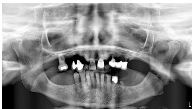
Figure 1. Pre-operative radiograph

and 5). Occlusion was confined to a supporting polygon with the occluding surfaces on the mesial side of the first molar and first and second premolars. The patient was satisfied by the esthetics and restored masticatory function (see Fig. 6 and 7). After one year metal acrylic restoration was changed to permanent metal ceramic restoration. All implants were firm. Preliminary three years recall showed good healing.