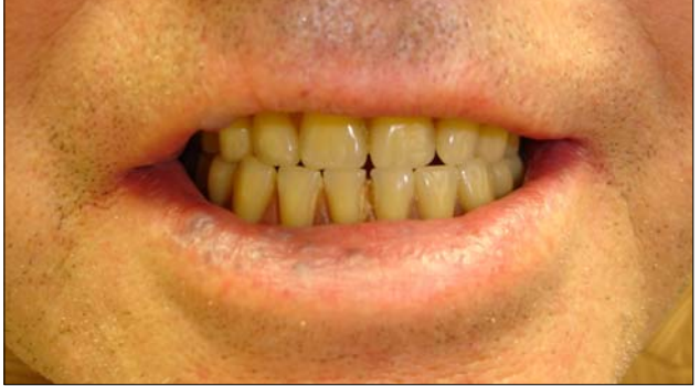
Fig. 5. Clinical visual aspect of Bridge