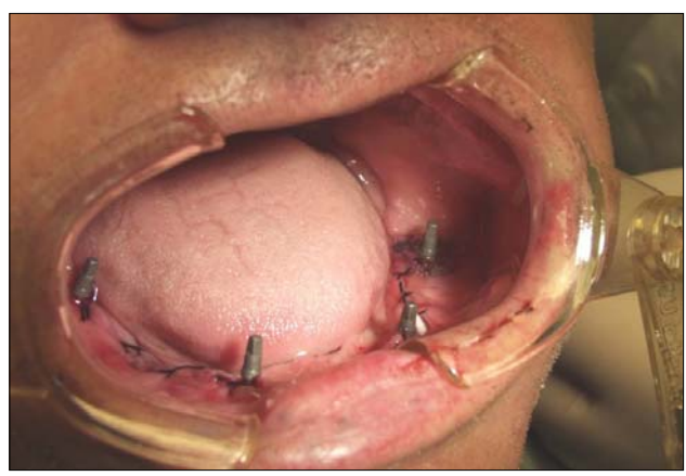
Fig. 3. Insertion of Implantat