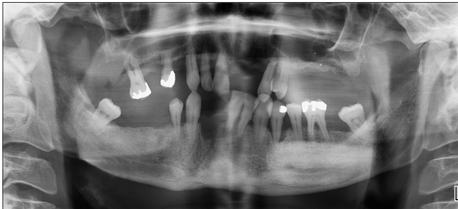
Figure 3: Preoperative panoramic overview picture, showing missing teeth, and uneven line of the first cortical in the upper jaw and multiple areas of decay and periodontal involvement. Due to an unfavorable plane of the tomography, we cannot see the elongated bone areas in the upper front