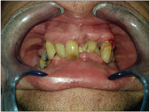
Figure 1: Intraoral view of the patient preoperatively. Besides the severe angle Class 2 jaw relationship, a remarkable overbite is visible. The upper front segment is severely elongated including the alveolar bone. This means that the alveolar bone will have to be removed to the region of the apex of the front teeth