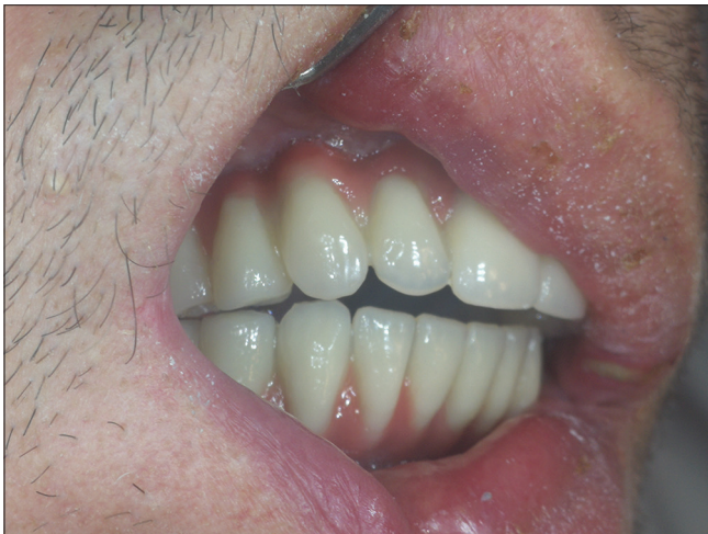
Figure 5: The surgical and prosthetic treatment had not made changes to the skeletal Class 2 jaw relationship. Since the bite was slightly lifted, the front teeth do not touch, neither in mastication nor in occlusion