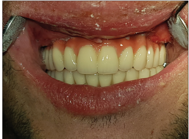
Figure 4: Overview on the intraoral situation immediately after fixation of both bridges with permanent cement