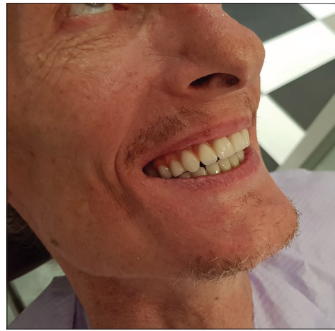
Figure 4: Intraoral situation immediately after permanent cementation of the two bridges