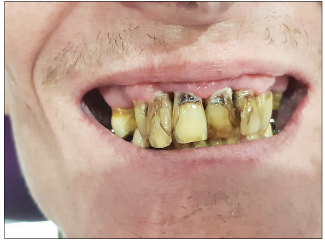
Figure 2: Preoperative appearance of the patient's normal smile