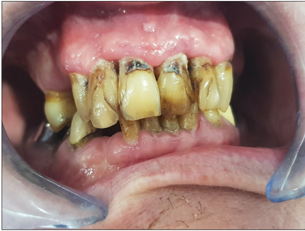
Figure 1: Preoperative intraoral view of an Angle Class 2 jaw relationship and a severe overbite. The maxillary anterior segment is severely elongated, as is the alveolar bone. Deep pockets with putrid exudates were found in all quadrants