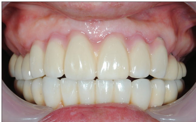
Figure 5: 3-year postoperative clinical picture of the upper and lower Metal fused to ceramic

lost 55 implants, whereas 50 implants were lost in another 38 patients. This indicates that implant losses may be associated to case-specific or patient-related factors, such as (cumulative) overloading of implants due to nonreduced chewing forces, [12] unilateral or anterior patterns of chewing, unequal mastication