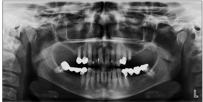
Figure 2: Preoperative panoramic overview before extraction and immediate placement of implants in the upper and lower jaw