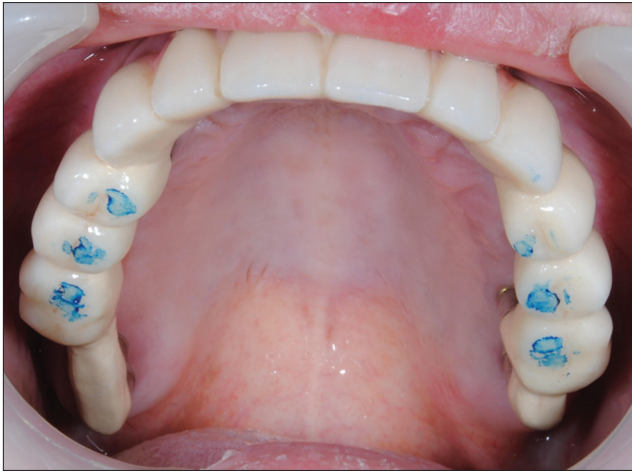
Figure 1: Ideal contact situation after insertion of the metal ceramic bridge in the upper jaw. The concept of “lingualized occlusion” is followed. Second molars are never placed on the bridge; if abutment heads are positioned distally to the first molars, they are prosthetically equipped as (veneered) technical abutments